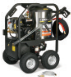
Extra-compact model: 39"L x 28"W x 42"H

Each unit is ETL certified to UL and CSA safety standards and has a Schedule 80 steel heating coil with stainless steel wrap. Heavy-duty Kärcher crank-case pumps feature brass cylinder heads and 7-year warranty.