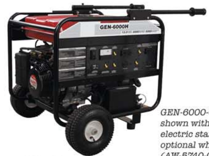
GEN-6000-OMSE shown with electric start and optional wheel kit (AW-5740-0004)